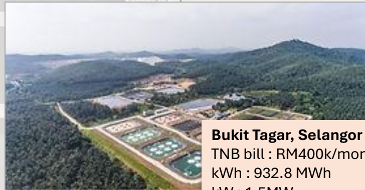
Bukit Tagar, Selangor TNB bill : RM400k/month kWh : 932.8 MWh kW : 1.5MW