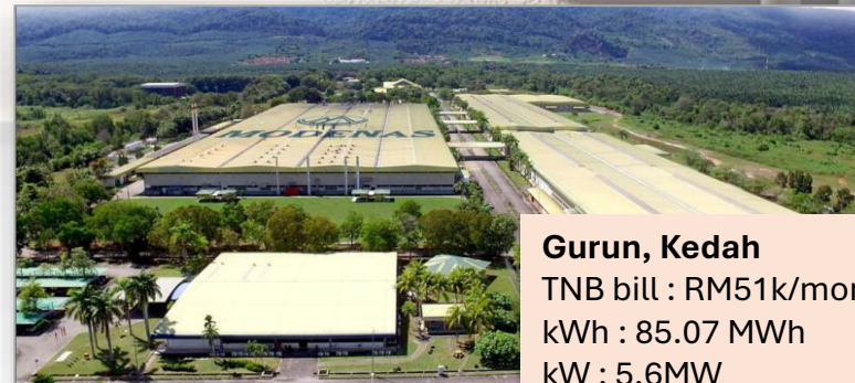
Gurun, Kedah TNB bill : RM51k/month kWh : 85.07 MWh kW : 5.6MW