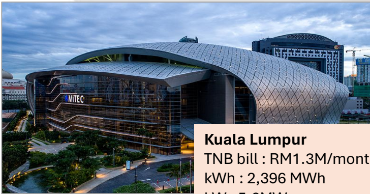
Kuala Lumpur TNB bill : RM1.3M/month kWh : 2,396 MWh kW : 5.6MW