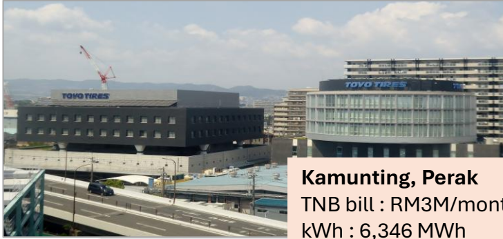
Kamunting, Perak TNB bill : RM3M/month kWh : 6,346 MWh kW : 12.5MW