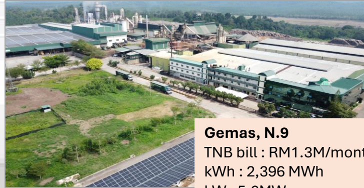
Gemas, N.9 TNB bill : RM1.3M/month kWh : 2,396 MWh kW : 5.6MW