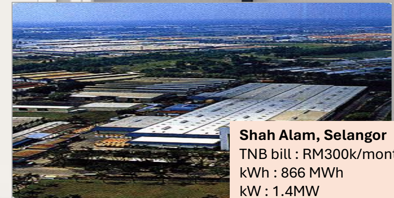
Shah Alam, Selangor TNB bill : RM300k/month kWh : 866 MWh kW : 1.4MW