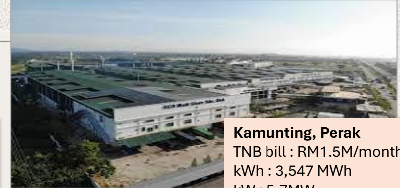
Kamunting, Perak TNB bill : RM1.5M/month kWh : 3,547 MWh kW : 5.7MW